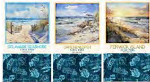
Blue Center 1 Blue Center 2 Blue Center 3