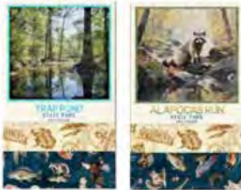
Jade Center 1 Jade Center 2