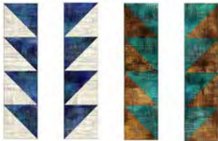
Left Blue Column Right Blue Column Left Jade Column Right Jade Column Make [1] Make [2] Make [1] Make [1]